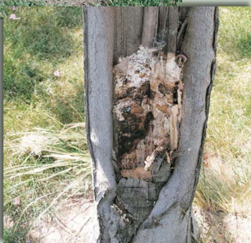
Trunk wound with advanced decay

Other publications in this series include: