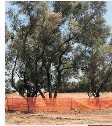
Protective fencing around trees to be preserved