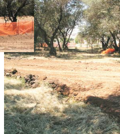
Keep access roads out of the root zones