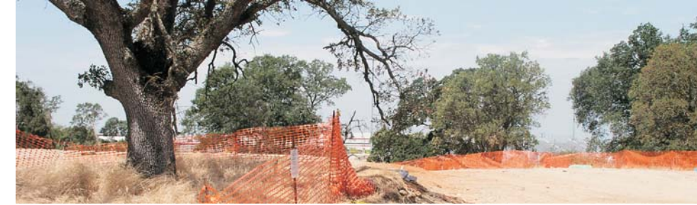
Make sure protective fencing is placed outside the dripline of all trees to be preserved